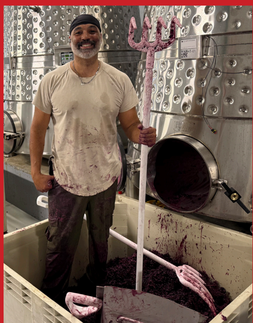
2025 is Harvest #23 for me, and I still got when it comes to shoveling out tanks.