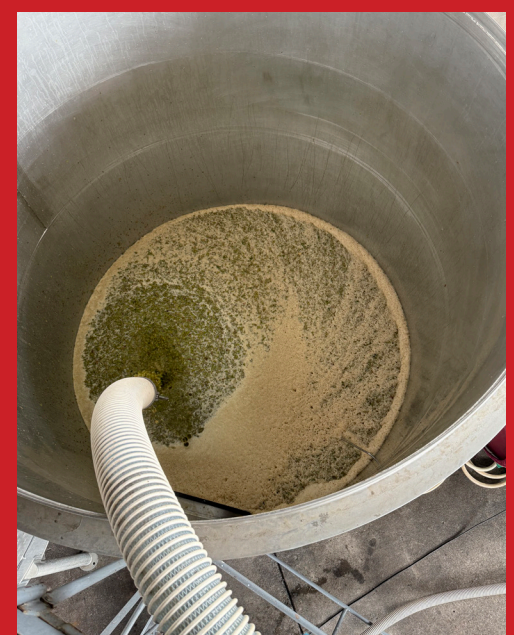
Skin Fermented SB? Oh snap! Too late for a spoiler alert...