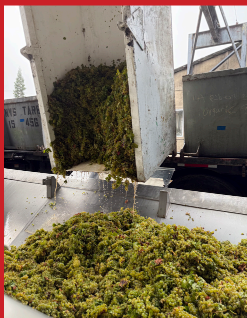
Would it even be a Fall shipment with a shot of SB on its way to become wine?